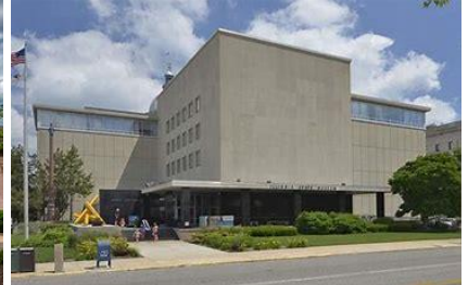
Edwards Place llinois State Museum