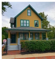
Christmas Story House