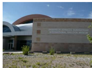
Hot Air Balloon Museum