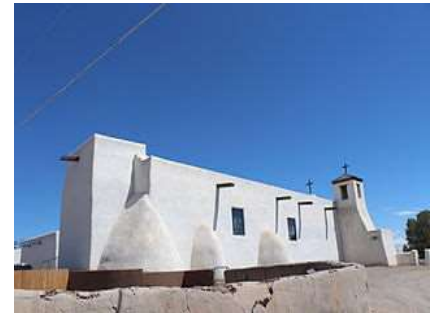
Pueblo of Isleta