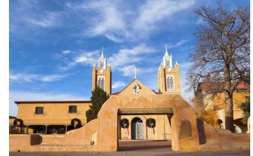
San Felipe de Neri Church