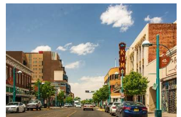
Route 66 Albuquerque

CACI - ABQ - 2023 c/o Barbara Accordino 5710 Hasbrook Drive Louisville, KY 40229