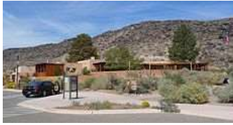
Petroglyph National Monument Visitor Center