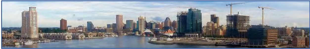
Panorama of the Baltimore Harbor