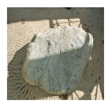
Plymoth Rock was the landing site of the second permanent English settlement in America

Our hotel contains 266 oversized guest rooms and sits on an 88 acre campus. There is complimentary shuttle service from the Providence Airport (the T. F. Green Airport) less than three miles away. The Crown Plaza (801 Greenwich Avenue, Warwick, RI; [401] 732-6000) is located just off Interstate 95 at Exit 12 and offers acres of free parking. For several years, it has won awards for outstanding service and superior quality. The hotel offers an indoor pool, whirlpool spa and sauna, a health and fitness center, an award winning restaurant (Remingtons) and Alfred's Library Lounge; as well as a business center and concierge service. All rooms have marble baths with two sink vanity, individually controlled air conditioning and heating, complimentary high speed access, 25-inch televisions and much more. The hotel has several service vans to provide complimentary shuttle service to nearby restaurants, shopping, etc. There will be a CACI Hospitality Room off the hotel lobby that will be open most days and evenings as well as for "after hours".