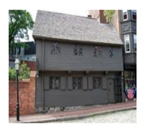
The Paul Revere House is on Boston's Freedom Trail