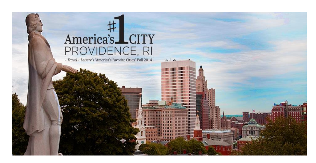
Statue of Roger Williams who founded Rhode Island in 1636 overlooks the city of Providence

Make your plans now to attend the fabulous 2015 Convention/Vacation of Catholic Alumni Clubs International scheduled at the Crowne Plaza hotel in the Providence, Rhode Island suburb of Warwick from Sunday afternoon, July 19 , to Saturday afternoon, July 25 . This 55th annual gathering of CACers from throughout the United States will include social events, daily mass, elaborate breakfasts, four hotel banquet dinners, a clambake on the shores of Narragansett Bay on Monday evening and much more in addition to opportunities to sign up for several historic and culinary tours .