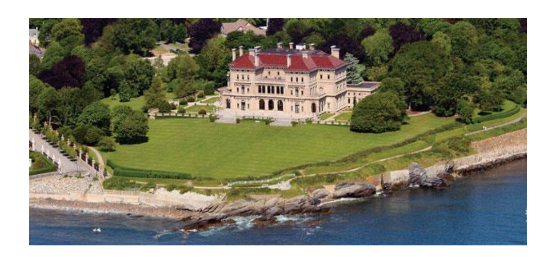
A spectacular view of one of the Newport "Summer Cottages" of the 1890's

On Monday evening, we will enjoy an authentic New England clambake and dinner on the shore of one of Rhode Island's beautiful beaches. For those not into clams, a steak dinner will be substituted.