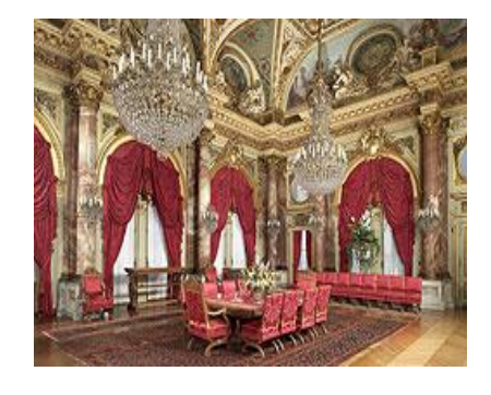
A view of the interior of "The Breakers", the Vanderbilt mansion constructed for $11 million in the 1890's