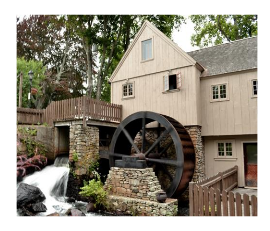
The Grist Mill is one of several reconstructed Plimoth Plantation sites.

Providence was named by Travel+Leisure magazine as the 2014 Number One Favorite City to visit. The city won acclaim for "brimming with New England charm", and being "a legitimate culinary capital" and having numerous historical elements. Other finalist cities included Minneapolis/St. Paul, San Francisco, Kansas City and Houston.